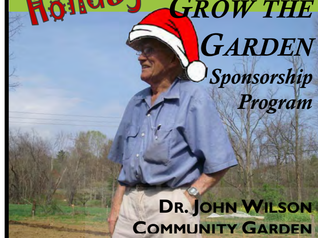
DR. JOHN WILSON COMMUNITY GARDEN