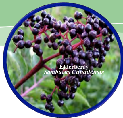
Elderberry Sambucus Canadensis

We are listed on the National Registry as a Botanical Plant Sanctuary. With the help of United Plant Savers we will introduce endangered plants and carefully foster them.